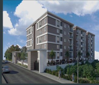
GO GREEN PARADISE KOMPALLY