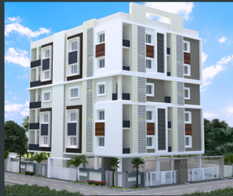
GO GREEN KALAYIKA MAJESTIC THUMKUNTA