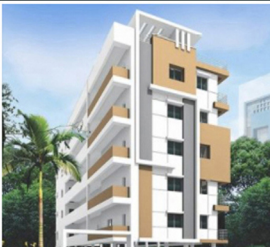
GO GREEN ARCADE AIWAL