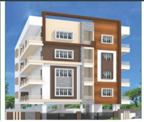
GO GREEN RENUKA HEIGHTS SURYANAGAR, AIWAL