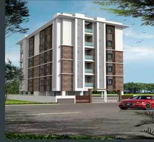
GO GREEN KRISHNA HEIGHTS THUMKUNTA