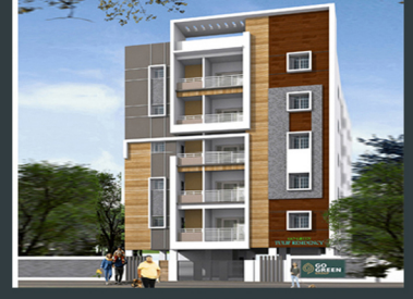
GO GREEN TULIP AIWAL