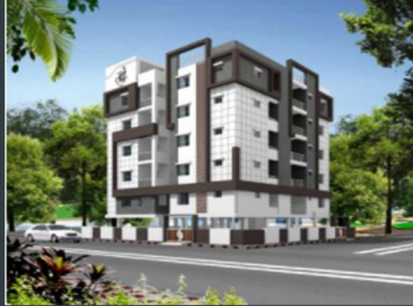
GO GREEN RADHA KRISHNA MANSION, YAPRAL