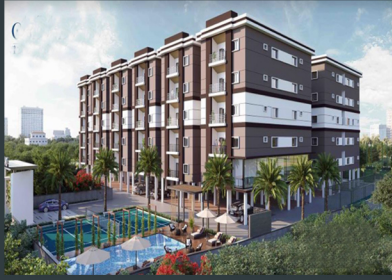
GO GREEN GRAND SIDDIPET