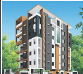
GO GREEN RAGHAVENDRA RESIDENCY, KONDAPUR