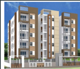
GO GREEN ELEGANT THUMKUNTA