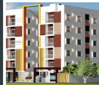
GO GREEN ORCHID THUMKUNTA