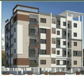
GO GREEN ENCLAVE SURYANAGAR, AIWAL