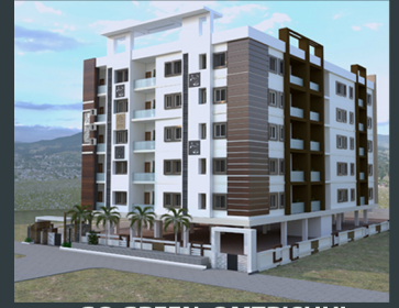
GO GREEN OMTRISHUL THUMKUNTA