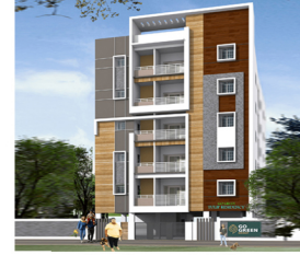
Go Green Tulip, Alwal