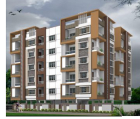
Go Green Arnav & Vajra Residency, Siddipet