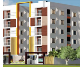
Go Green Orchid, Thumkunta