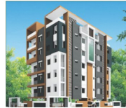
Go Green Raghendra Residency, Kondapur