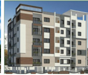
Go Green Enclave, Suryanagar, Alwal