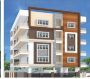
Go Green Renuka Heights, Suryanagar, Alwal