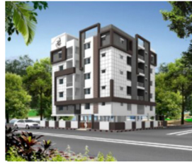
Go Green Radhakrishna Mansion, Yapral