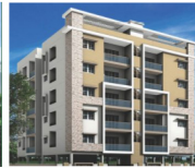
Go Green Avenue Alwal