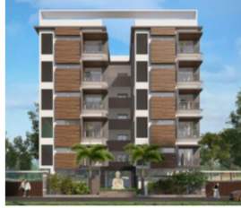
Go Green Castle, Kompally