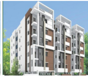
Go Green Parimi Heights, Alwal