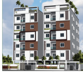
Go Green Arihant Kalayika, Bolarum