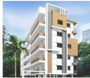
Go Green Arcade Alwal