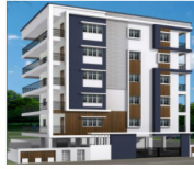
Go Green Heights, Venkatarope, Alwal