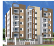
Go Green Elegant, Thumkunta